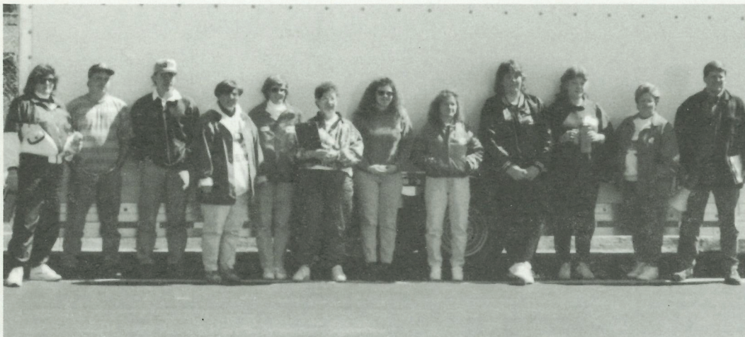
This year's Volunteers.