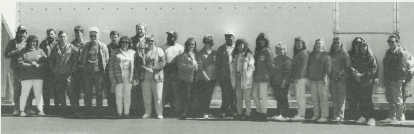
Contestants from across the state.