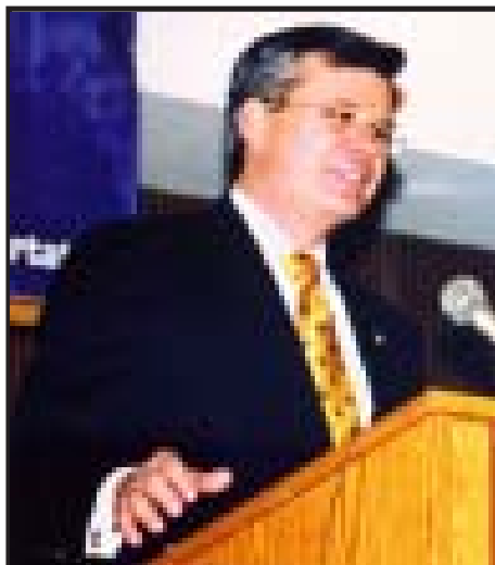
Kentucky Governor Ernie Fletcher spoke to the members of the Kentuckians for Better Transportation at their Conference in January.

Association (KPTA) Board selected Lexington at the last KPTA Board Meeting. The membership was very pleased with the location of the rodeo and having an indoor vendor expo was one of the comments made by many attendees.