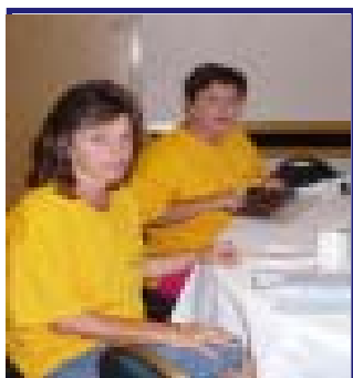
Breakfast before the KPTA Roadeo.