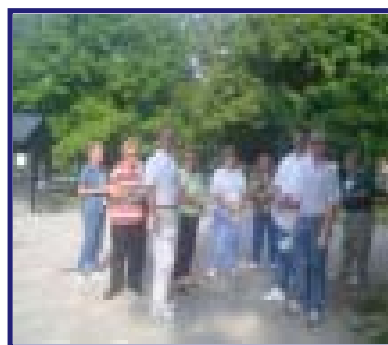
KPTA members on their tour to Shakertown.