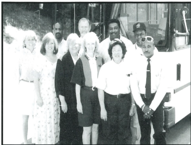
TANK's employees shown in front of one of their buses.

TANK will be honored for this achievement at APTA's Annual Conference, being held in Chicago, Illinois in September.