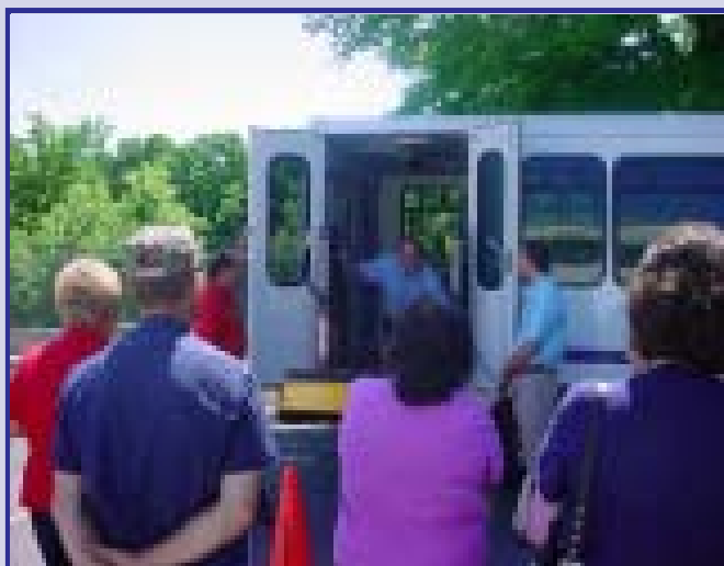
Several individuals from RTEC, LKLP, CVADD and Daniel Boone attended the Braun training at RTEC.